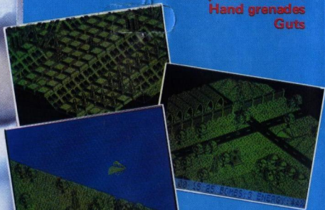
Screen shots taken from Spectrum

Kit: One hangglider (collapsible) One motor unit (convertible Bicycle/Microlite) Hand grenades Guts