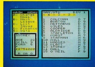
SQUAD DETAILS - 100 Teams - Details of over 1500 individual players