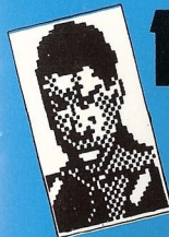
FRANK BRUNO GREAT BRITAIN