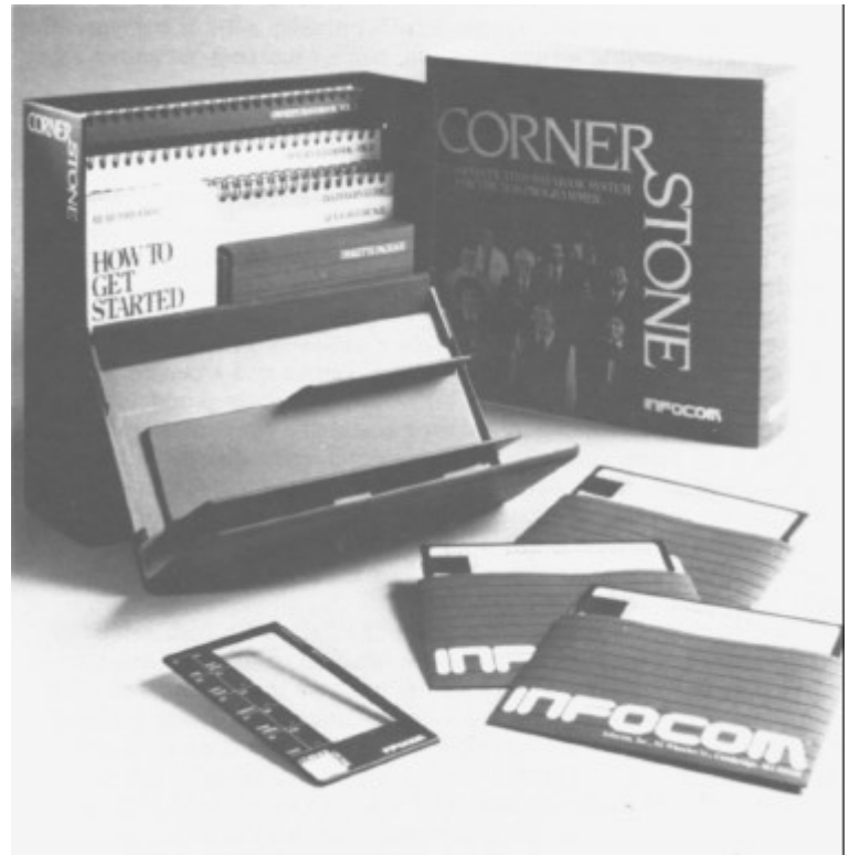
Cornerstone: The sophisticated database system for the non-programmer.