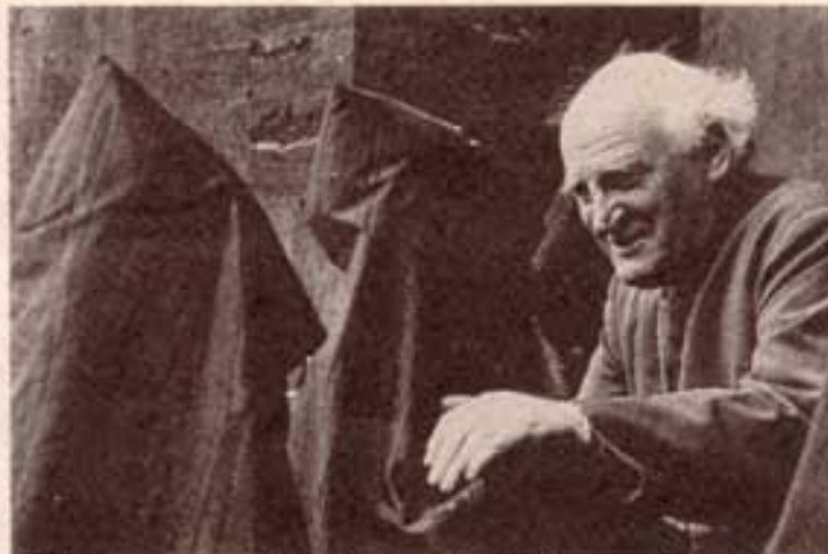
Jannedor (left) meets Prince Herbert the Not Quite in happier times

This threat is a banana-skin under Aquitania which will boomerang like a rabid quagmire before coming home to