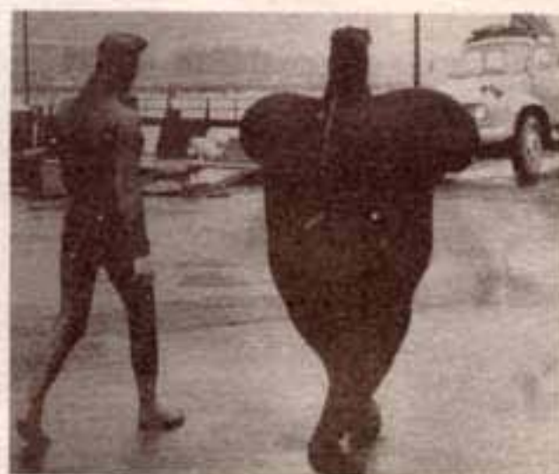
The Kwazi Delegation

Welt, speaking from his cell, said: "We wuz relaxing after a hard wosname. All we wanted was a quiet cheese sandwich when in comes this wosname with half-a-dozen scantily-clad wosnames. We told her to cheese orft, and next thing we knew we was banged up. It's a disgrace."