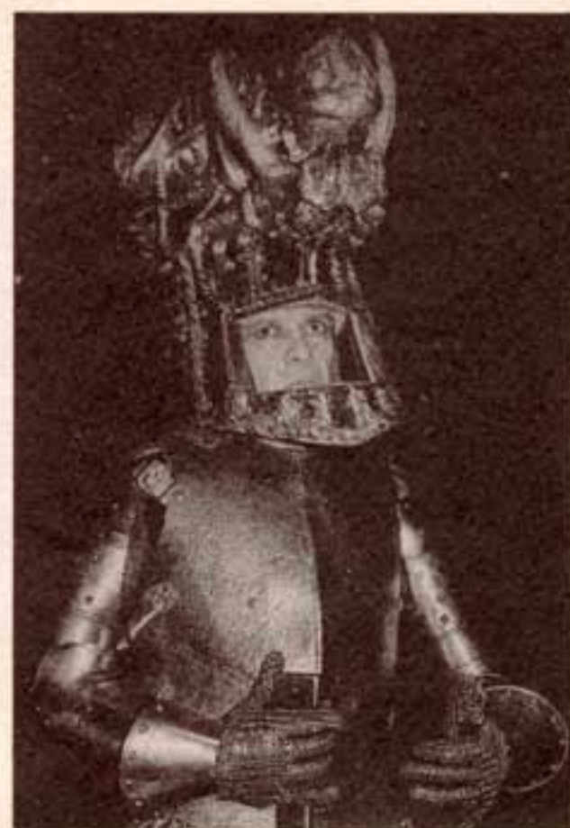
King Derek the Confused at the Battle of Duvet

Some fifty years leater, the Guardians were in action again, fighting for King Derek the Confused against himself in one of the great rearguard actions of the Silly War. Contemporary sources cite the Guardians' role as "negligibble: They just Hange aroundd with much Drinking and Fondling.