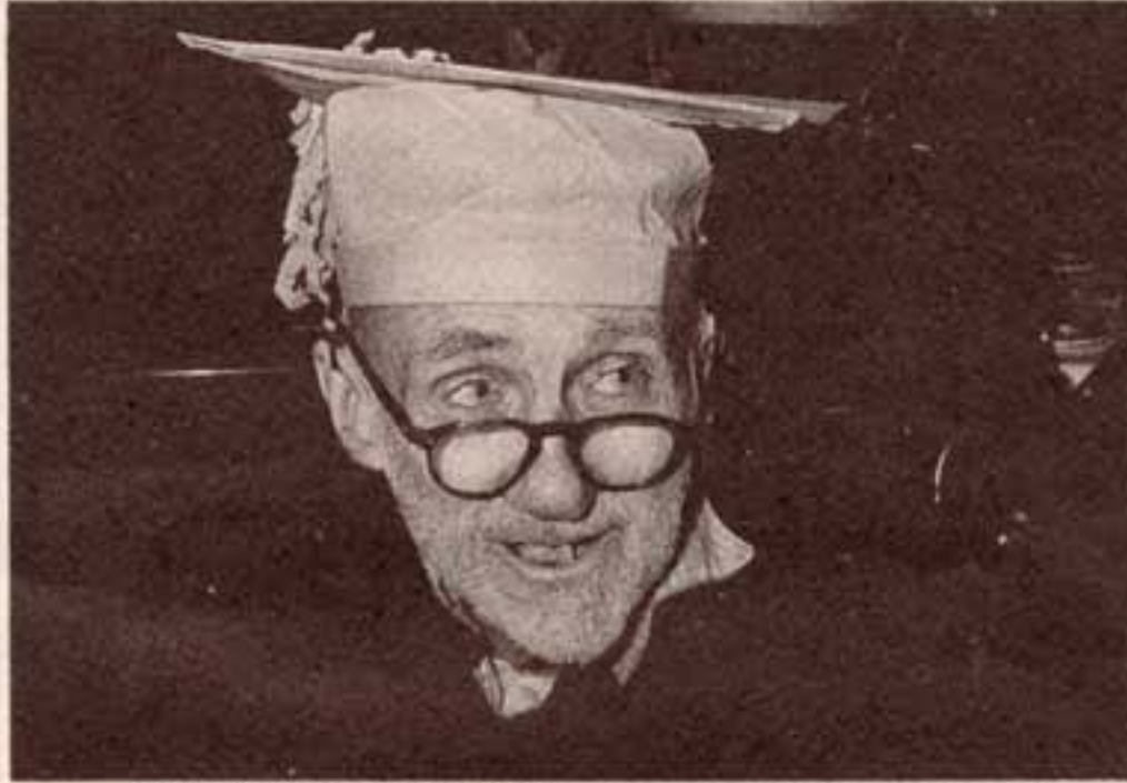
Starborgling: "No cause for alarm."

The Jannedor threat was first brought to the at-