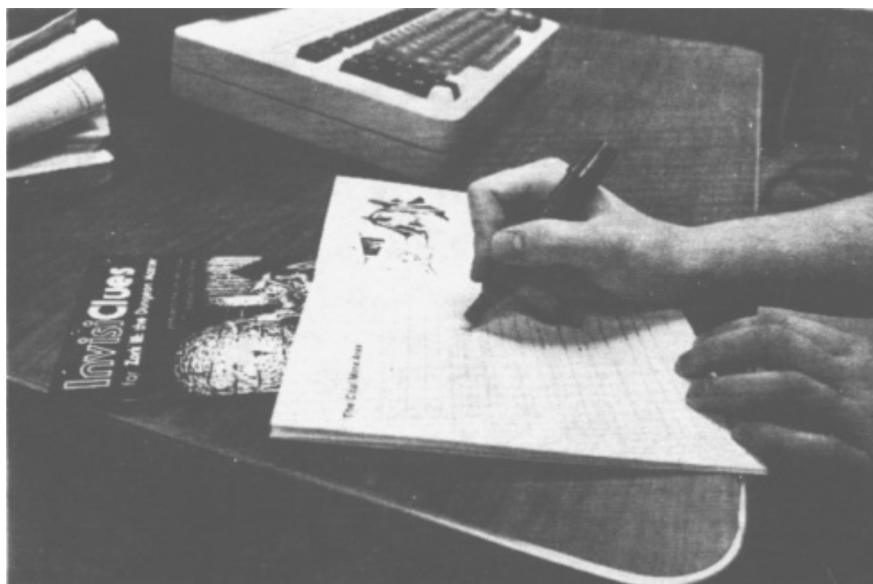
InvisiClues . PC magazine called them, "almost as much fun as Zork ." They are fun, and quite useful, too. Even experts who have finished the game will find out about things they missed.

We now have the solution: heat transfers! The Zork logo (brown, yellow, and black) has been printed with special heat-transfer ink. We will ship you the transfer sheet which you can take to a T-shirt shop which does heat transfers. There you can pick out the T-shirt of your choice. (Note: using a standard household iron is not recommended; however, a photographer's mounting press can be used.)