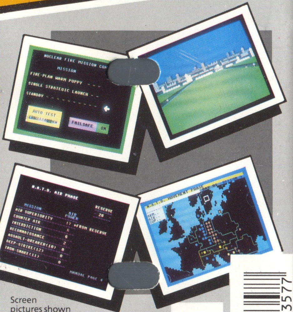
Screen pictures shown may be a different machine version of game