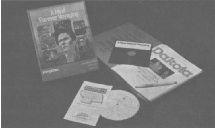
Items from Dr. Perleman's desk are contained in every A Mind Forever Voyaging package.