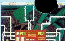
Screen shots from Amiga version