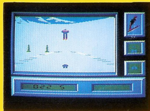
AMSTRAD cpc SCREENS